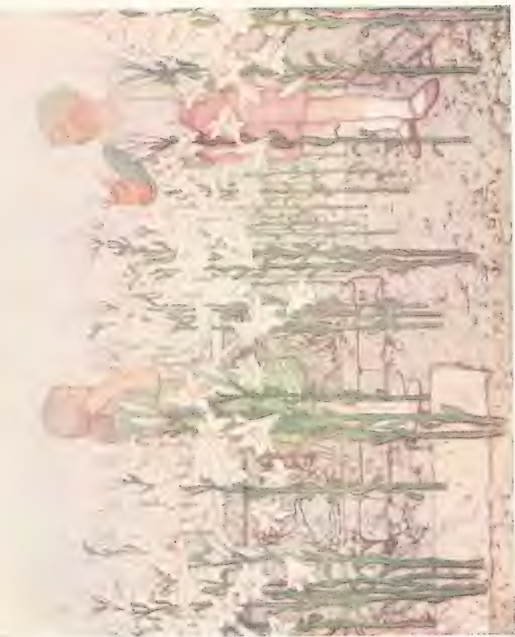
SCULLY TURNS THE DIAMOND